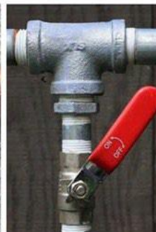
Galvanized Steel & valve